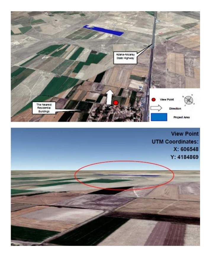
Figure 2: The view of the Yaysun Solar Power Plant site from the nearest settlement to the east