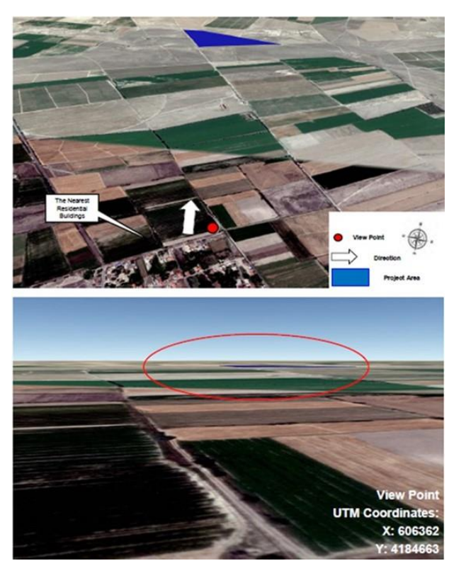
Figure 3: The view of the MT Doğal Solar Power Plant site from the nearest settlement to the east

Figure 2: The view of the Yaysun Solar Power Plant site from the nearest settlement to the east