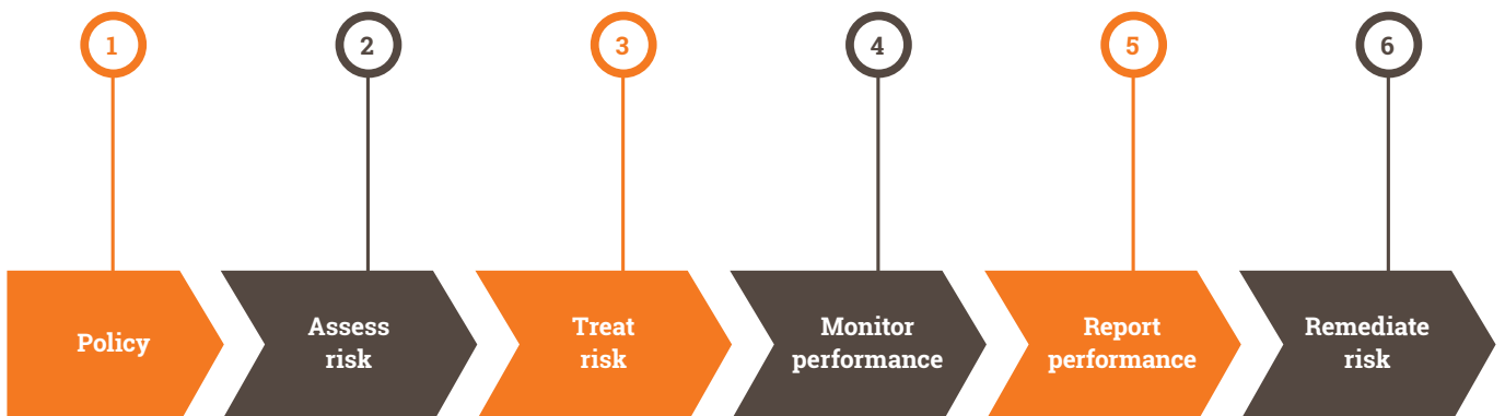
Figure 3: The six stages of the due diligence process, based on the UN Guiding Principles on Business and Human Rights.

Phase 2 also included in-depth interviews with internal subject matter experts to clarify and validate the findings.