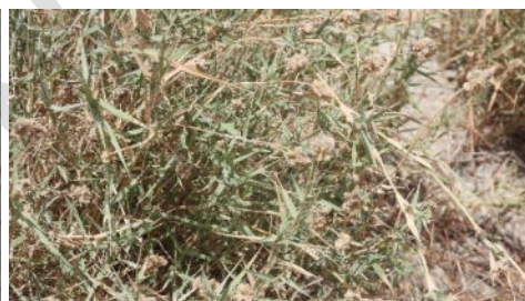
Aeluropus lagopoides (L.) Thwaites