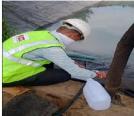
Groundwater sample collection near Khavda village