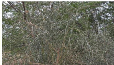
Capparis decidua (Forssk.) Edgew.