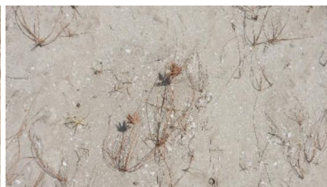
Cyperus conglomeratus Rottb.