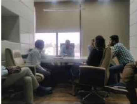
Discussion at GSECL Office