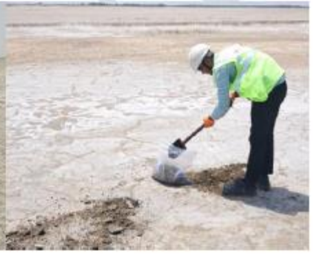
Soil Sample Collection within Study area