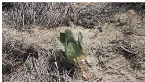
Calotropis procera (Aiton) Dryand.