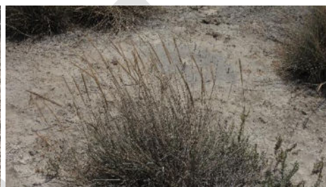
Urochondra setulosa (Trin.) C.E.Hubb.