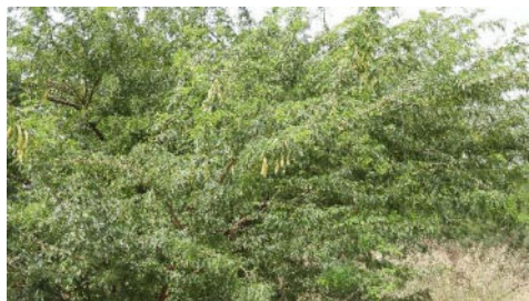
Prosopis juliflora (Sw.) DC.