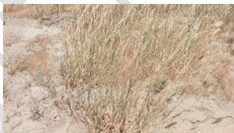
Chloris barbata Sw.