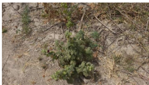
Senra incana Cav.