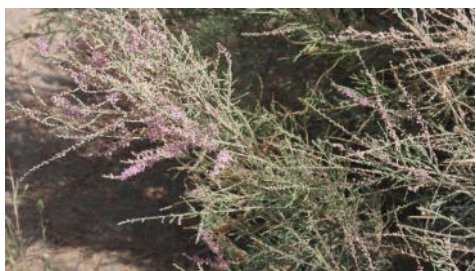
Tamarix indica Willd.