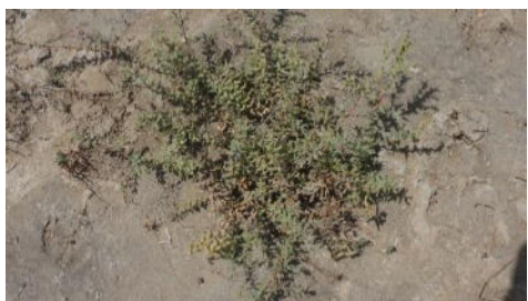
Suaeda maritima (L.) Dumort.