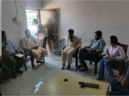
Consultation with Local Community