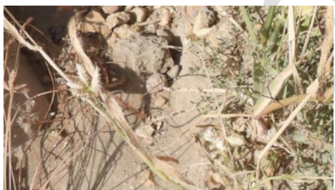
Dactyloctenium scindicum Boiss.