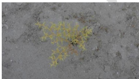
Zygophyllum simplex L.