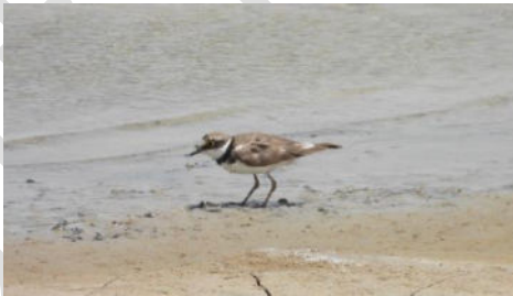
Little Ringed Plover