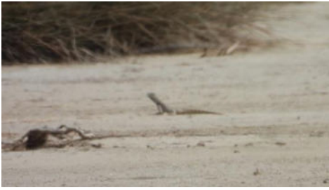
Brilliant Ground Agama