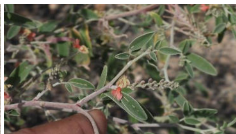
Indigofera oblongifolia Forssk.