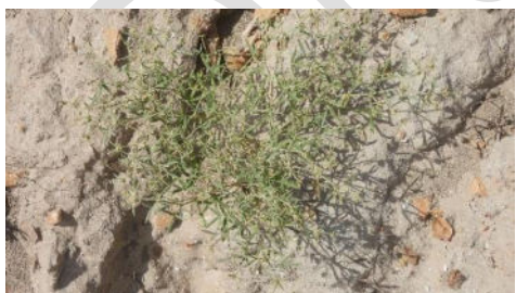
Zygophyllum paulayanum (Wagn. & Vierh. ex Vierh.) Christenh. & Byng