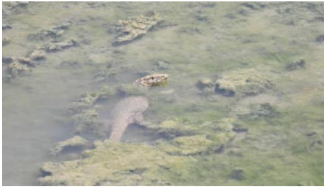
Bengal Monitor Lizard