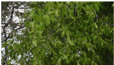
Salvadora persica L.