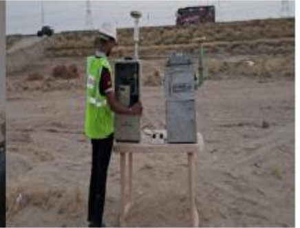
Air Monitoring conducted within Study area