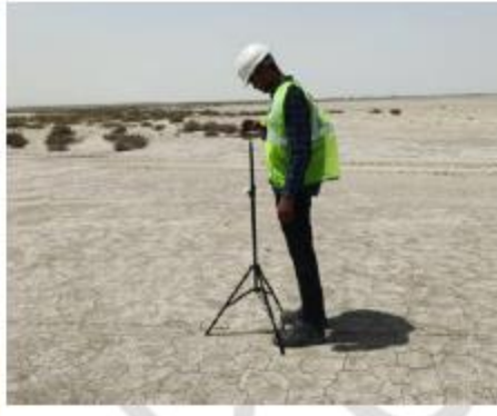
Noise monitoring within study area