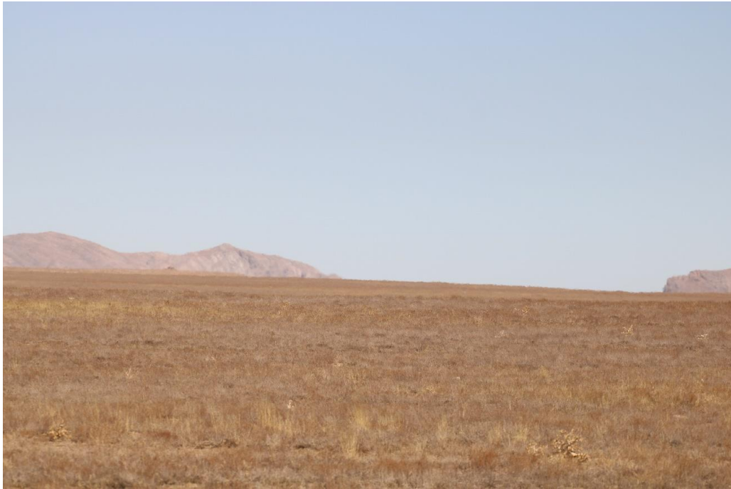
Figure 1-3: Core Project Site Area