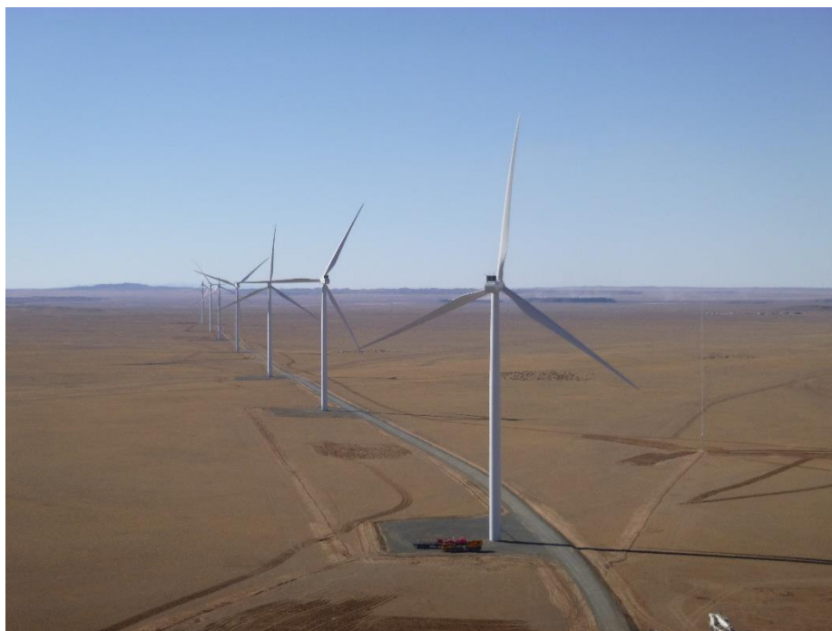
Figure 1-2: Typical Wind Turbines

Wind power is energy obtained from the wind. To be able to produce electricity from wind, a wind turbine is used. The turbines will have a tower and three blades with a total height to the tip of the blade of 172.5 m. Typical wind turbines are illustrated in the photograph below.