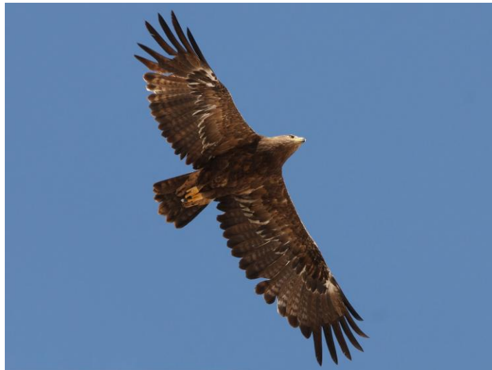
Figure 2-1: Steppe Eagle 1

The key potential impact during operation is the potential collision of birds with wind turbines, particularly species of conservation concern present at the Project site including the Cinerous Vulture, Eurasian Griffon Vulture, Egyptian Vulture and Steppe Eagle. The assessment identified the potential for significant impacts on these four species during operation.