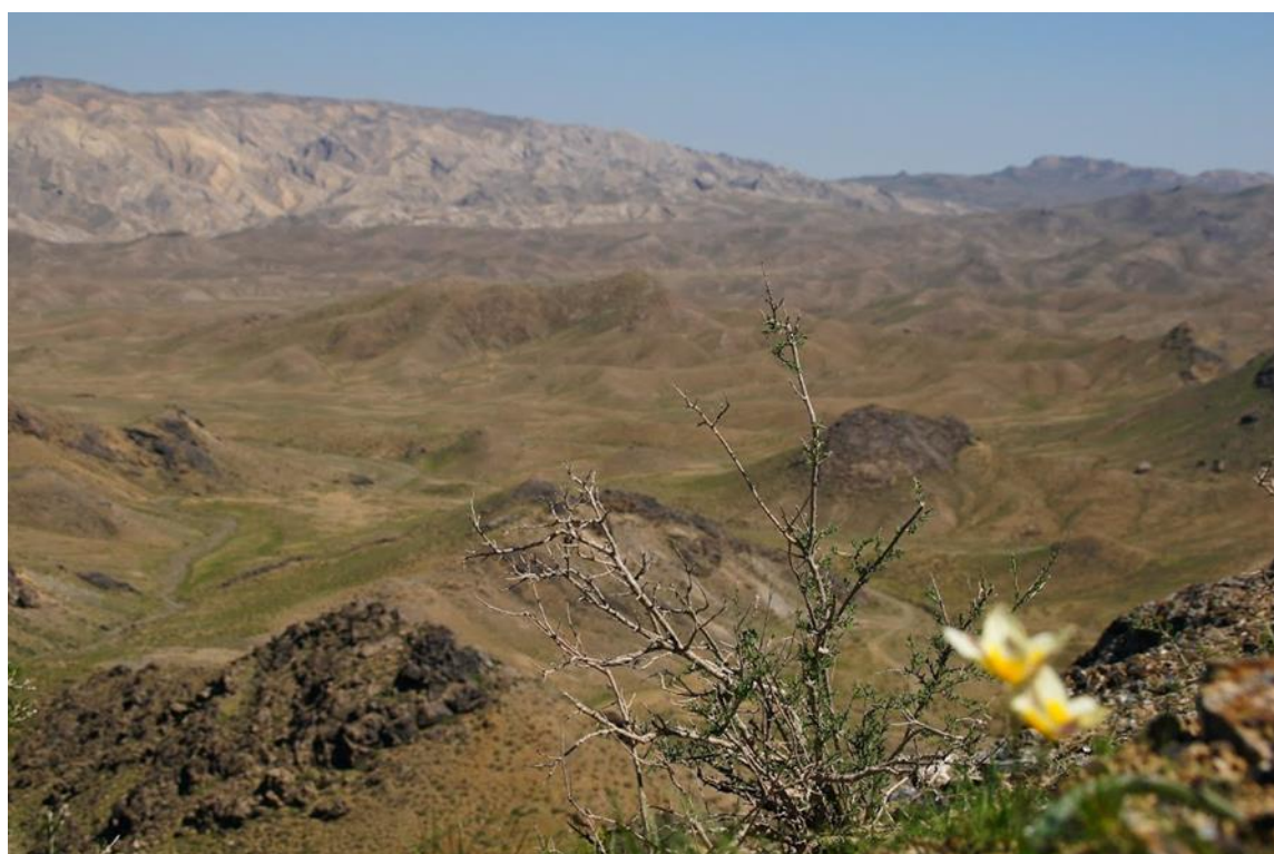
Figure 2-2: Project Area – Rocky Deserts LCT

An assessment of landscape and visual impacts has been undertaken. Seven viewpoints have been identified within the 35 km study area for the visual assessment. The Project is located within the Kyzulkum desert and is considered to largely be within a Rocky Deserts landscape character type (LCT). The photo below, illustrates the Project site area and landscape type.